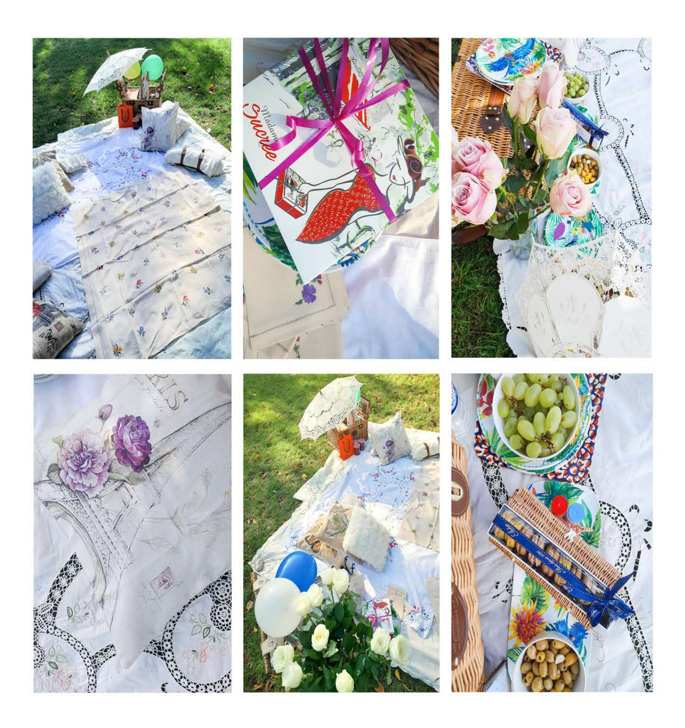
Our Stylish Deco picnic enjoyed at the park with friends and family. A perfect lunch break after a morning visit to the Eiffel tower.