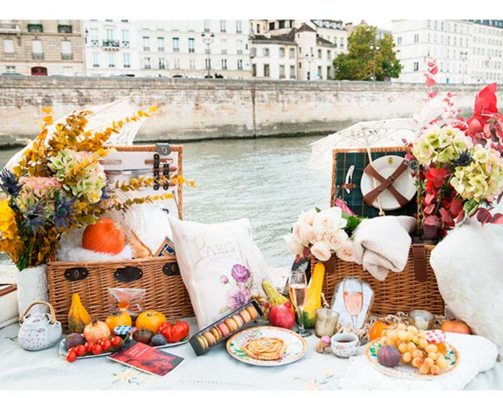
Classic & Elegant gourmet picnic experience.