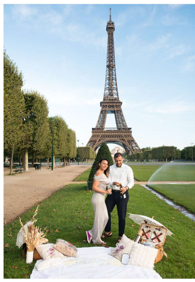
A Sunrise gourmet picnic set up & a professional photo session! Paris all to yourself!