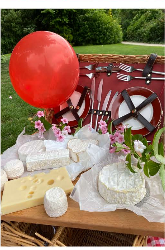
Our traditional gourmet picnic set up for a festive event.