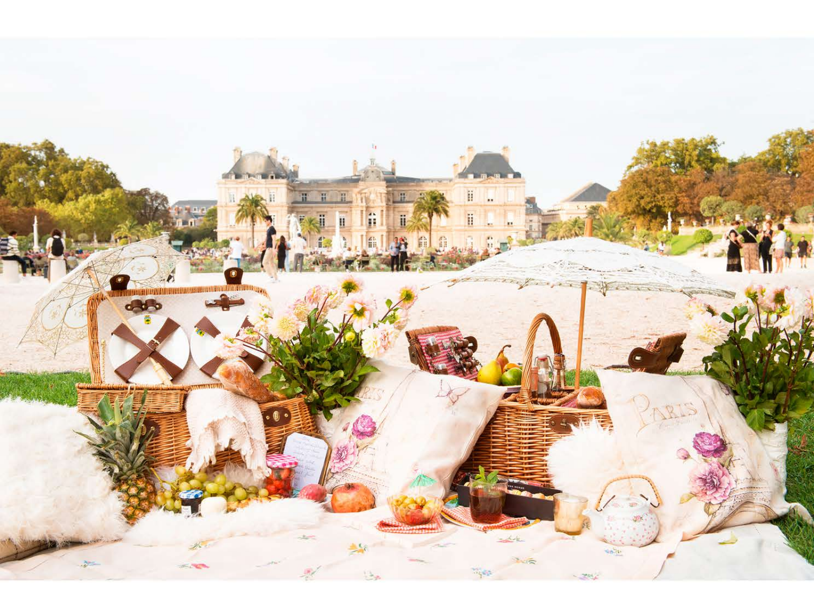
Classic & Elegant Gourmet Picnic Experience.